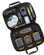
Both multimode and singlemode sources are available in the FTK1450 Complete Verification Kit